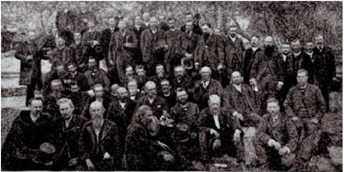
CONGRESS OF PHYSICIANS