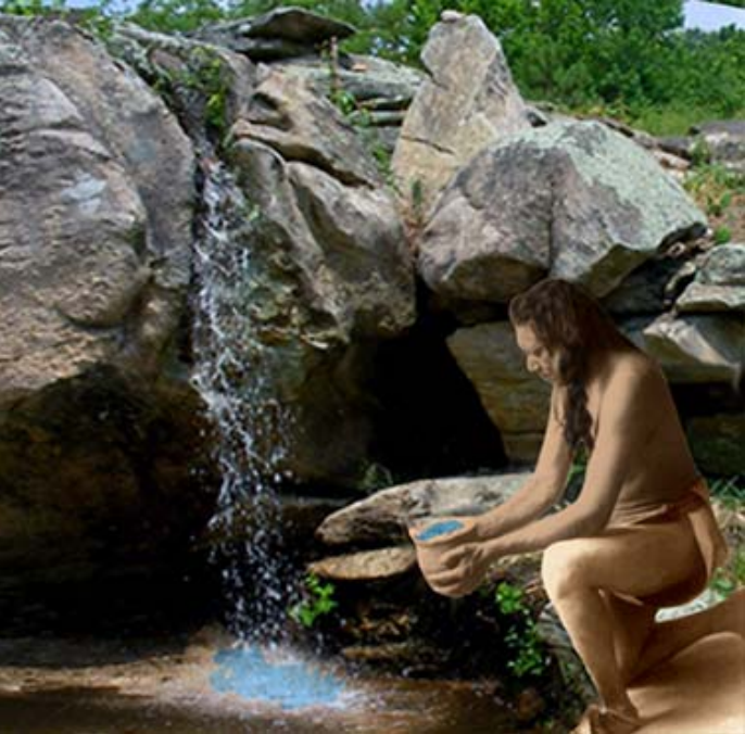
Medicine Man Lithia Springs GA

At a time before known history, humans made pilgrimages to Lithia Springs to drink its healing waters. The rituals of the medicine men invoked the natural and supernatural healing powers of the spring and its water. Neolithic artifacts discovered at Lithia Springs attests to prehistoric visitations thousands of years ago.