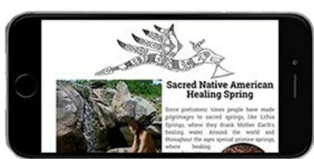
Mobile View In Landscape